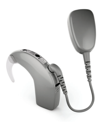
The Baha 5 SuperPower Sound Processor Fitting range up to 65dB SNHL